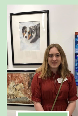
Snow Dog by